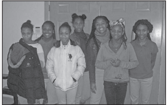
After completing their lesson plans and enjoying chess, the girls and my two high school assistants pose for a picture before leaving for their homes.