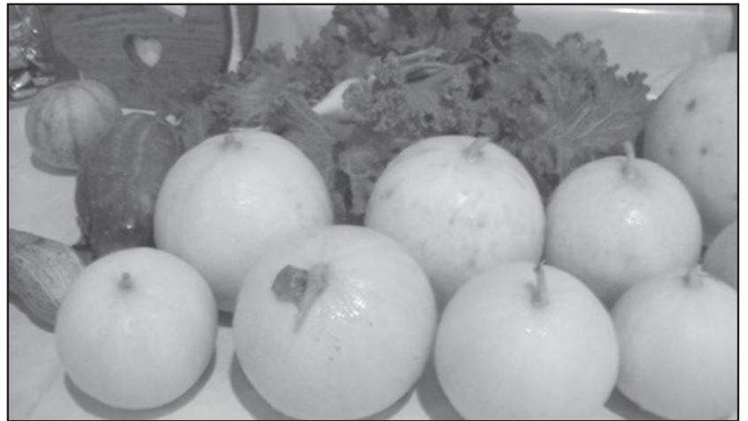
In addition to the greens, we picked melons and cucumbers, that surprising to us, were continuing to grow.