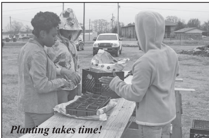
Planting takes time!