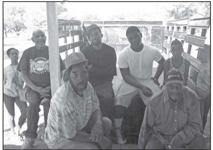
Jonestown volunteers who moved the furniture, books, supplies, etc. from storage in the fire station to the building.