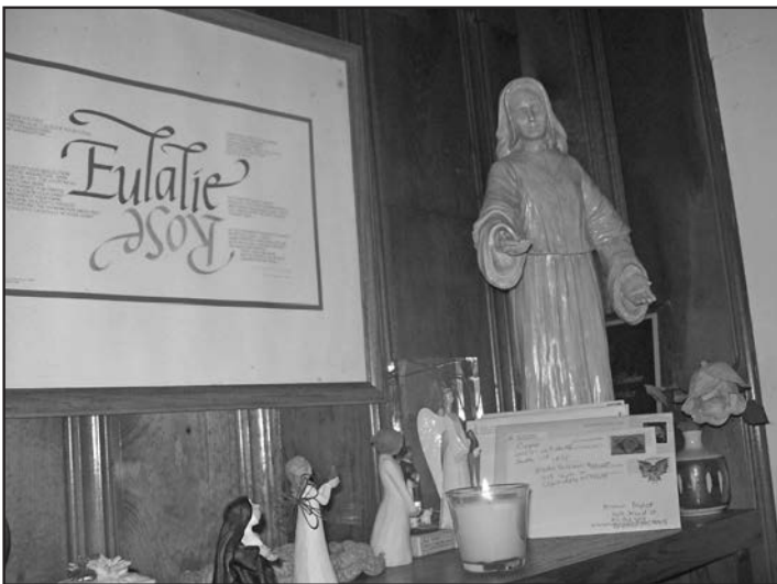
Early November letters