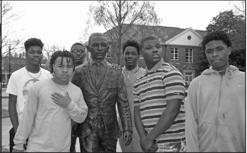
A highlight of the campus tour was "meeting" James Meredith. Since our Summer School focus in June will be the life and legacy of James Meredith and since several of these boys will be helping to teach Summer School, it was a fortuitous "meeting".