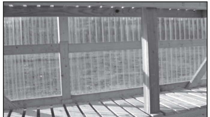
We have four nice red-wood shelves for our trays.